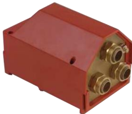
With brass plate with BW20