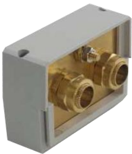
With brass plate with BW

Manufactured from brass, the live, neutral and earth terminals are fully insulated.